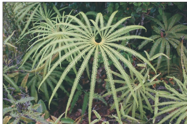
Fig. 1 A leptosporangiate fern ( Matonia pectinata R. Br.) from Malaysia.

The best-known and largest lineage of ferns is the leptosporangiates (Fig. 1), a monophyletic group of