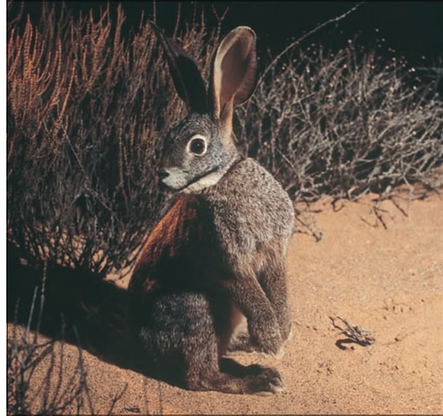
Fig. 1 A Riverine Rabbit ( Bunolagus monticularis ) from South Africa.

The fossil record of the Lagomorpha dates back to at least 45 Ma (1, 7) and the oldest fossil member of the Ochotonidae is known from the early Oligocene of Mongolia ~33–32 million years ago (10). Erbajeva (11) proposed that during this same period the Leporidae and the Ochotonidae started to diverge from each other and although this date falls within the 40–30 million years suggested by Dawson (7), it is more recent than the 50 million years proposed by Benton (12). Analyses of 58 presumptive structural allozyme loci estimated the time of divergence between the Leporidae and the Ochotonidae at 37.5 Ma (13). Using seven gene regions (mtDNA and nuclear introns), the age of the divergence among the families was estimated at 31.7–29.0 Ma in Bayesian and maximum likelihood analyses that used multiple calibration points and allowed for heterogeneity in molecular evolutionary parameters among genes (6). The 95% credibility interval in this study was estimated